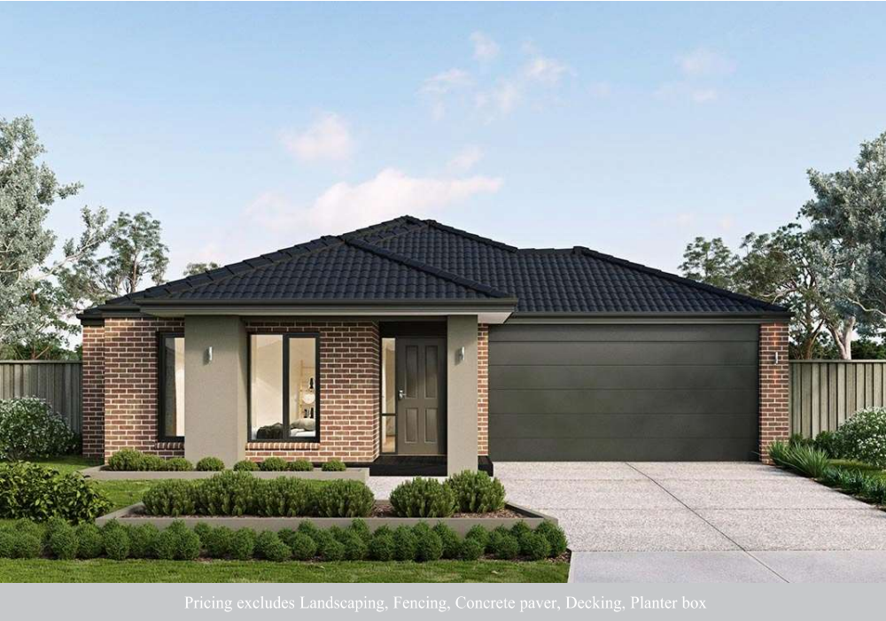
Pricing excludes Landscaping, Fencing, Concrete paver, Decking, Planter box